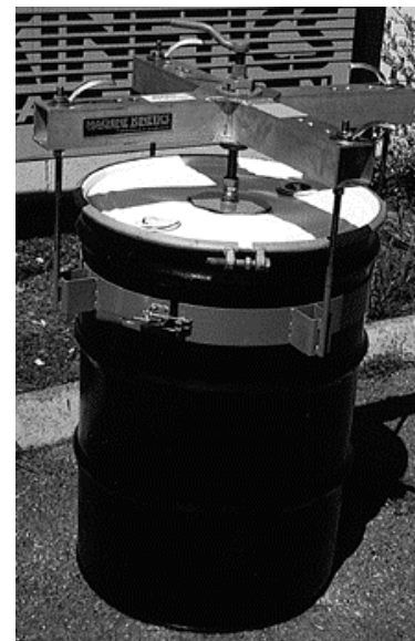
Figure 3. Sample Engineering Controls for Opening Potentially Pressurized Drums (left, Drum Web 5585 from EET Corporation [3]; right, rigid-device from Machine Kinetics).